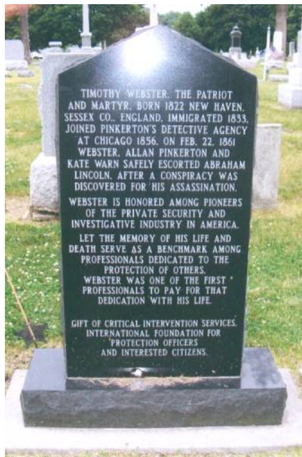
on Memorial Day, 2007 in Onarga, IL.