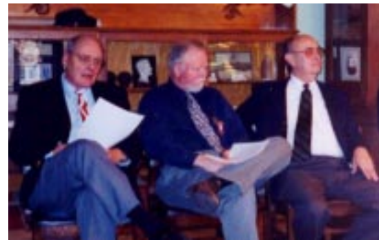
Some Brothers of Camp#24 engrossed in the proceedings at the encampment.